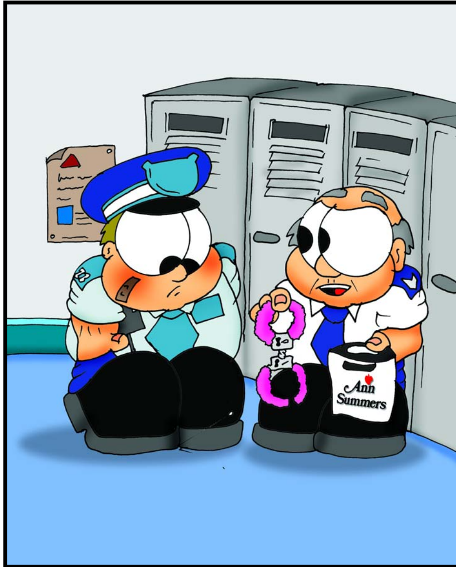
"I don't think these are regulation issue"