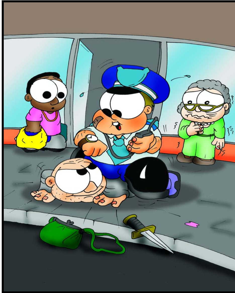
"Hurry up I need a PC!!..I've only 1 minute to go before I've got to release him."