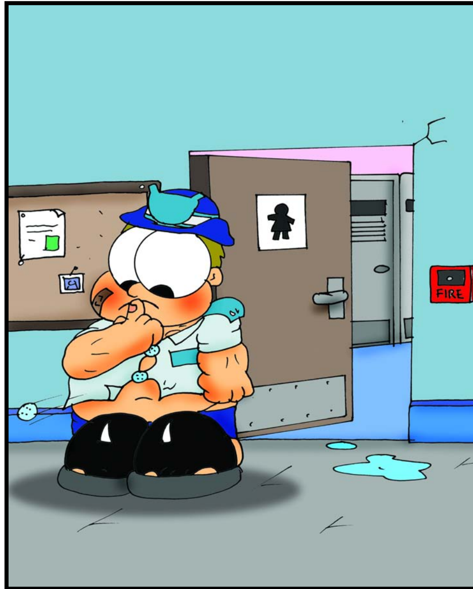
I think I got the wrong changing room!