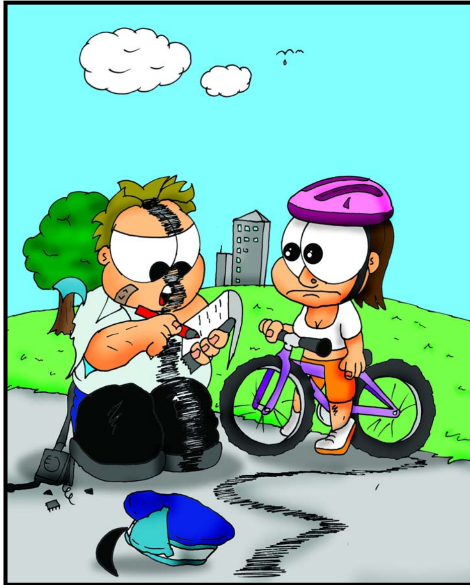
"Now, there's a good reason bikes shouldn't ride on the pavement!"