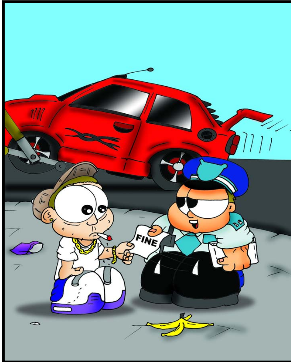
"I may not be the Police but good old Section 59 comes in handy"