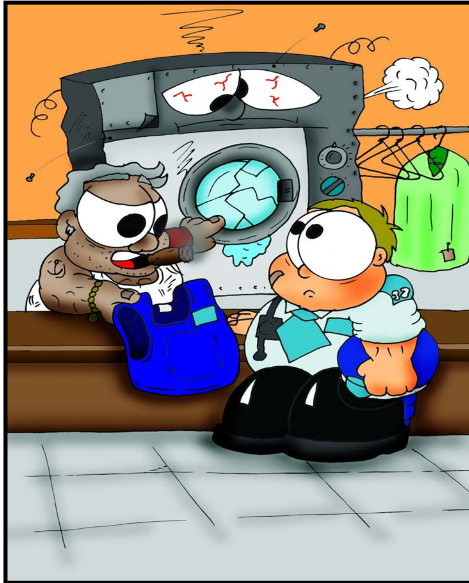
"DAMN YOU!!!!...Your stab-proof jacket destroyed my dry cleaning machine!"