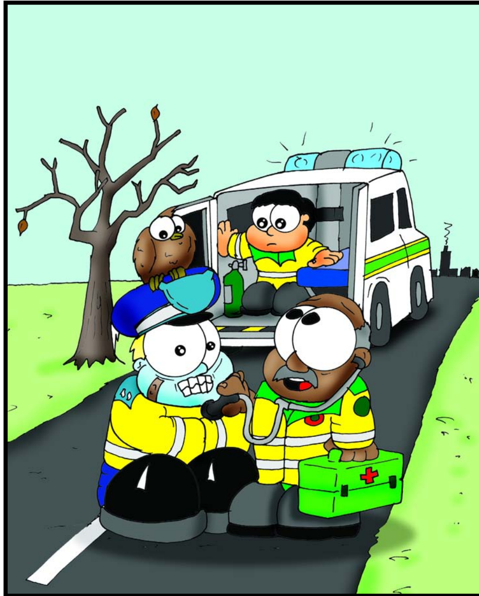
"Looks like another PCSO effected by a freezing patrol"